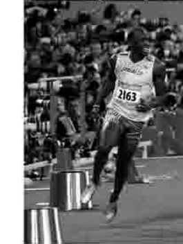
Usain "Lightning" Bolt

Looking back over the last three weeks there has been much to enjoy; the fantastic opening ceremony, the overwhelming brilliance of Michael Phelps in the swimming even despite the fact he now has more medals than Mark Spitz, my boyhood hero, mainly because his birthday is the same as mine, the sheer speed of Jamaican Usain Bolt 100 meters and 200 meters, Great Britain winning their biggest number of gold medals in 100 years and amusingly, for the first time ever that I can recall, the way the American media have tried to portray the US as still being top of the world by counting the total amount of medals won instead of the customary method of number of gold medals. Amusing as that maybe,