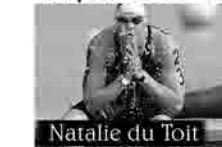
Natalie du Toit

it's been one of the best Olympics ever for me. We've seen Lopez Lomong carry the American flag into the Opening Ceremonies ... what a story that is ... a young man who spent a decade in a Kenyan refugee camp and came to the Olympics as a world class runner representing his adopted country and then, Natalie du Toit of South Africa, a marathon swimmer despite her left leg being amputated at the knee after being stuck by a car seven years ago, who is now the first amputee to compete in the Olympics.